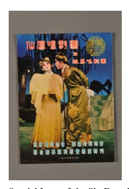
Special Issue of the Sin Fung Ming Opera Troupe and the Chor Fung Ming Opera Troupe