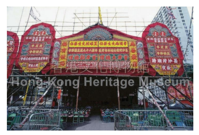
Cheung Sha Wan Bamboo Shed Theatre of Ritual Performance 2000

his finger in cinnabar ink the Chinese characters meaning "Great Luck" on a pillar beside the shrine for the theatrical patron gods. Then the other performers will start make-up for the performance. It is required that the four strokes forming the square component in the Chinese character for "luck" cannot join together to form a "closed" square, otherwise the performers' mouths will also be closed, which is a big taboo on stage. Sometimes the comedian-role will write these two Chinese characters all in one continued and unfragmented stroke, which means a continued business and a lifelong living.