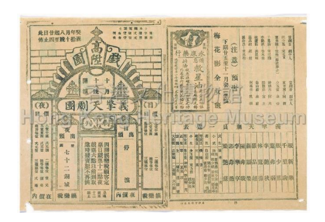
Postbill for the Performance of Yi King Tin Opera Troupe at the Ko Shing Theatre