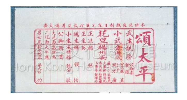
Advertisement of Chung Tai Ping Troupe Early 20<sup>th</sup> century

During the Japanese Occupation Period (1941 to 1945), Sit Kok Sin and Ma Sze Tsang returned to Guangzhou, and so the "Sit-Ma Rivalry" era was over. It was the most difficult period for the theatre business in Hong Kong as many other Cantonese opera artists also left the city. After the war, celebrated Cantonese opera artists who had fled to the mainland and overseas gradually returned to Hong Kong. Together with the younger artists, they formed various troupes and performed at various theatres. Cantonese opera started to prosper again.