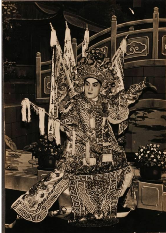
A Scene from the Opera The Sword