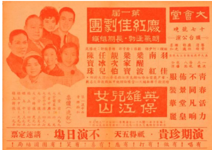
Postbill of the 1st Performance of the Hing Hung Kai Opera Troupe Repertoire: The Brave Young Ones Rising to Defend the Nation