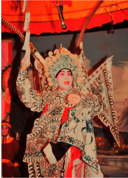
A Scene from the Opera The Brave Young Ones Rising to Defend the Nation