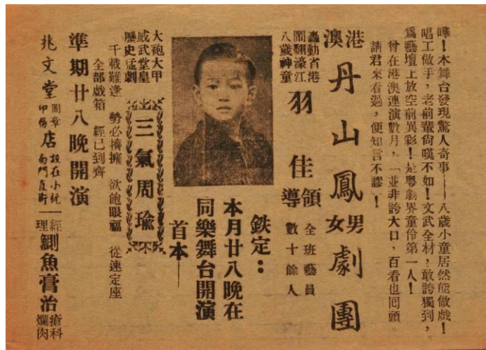
Postbill of the Dan Shan Fung Men and Women's Opera Troupe

Repertoire: How Zhou Yu was Thrice Defeated